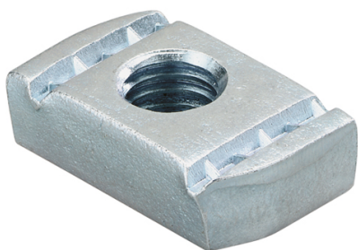
Channel nut FCN